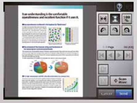
Preview screen (Scan viewer)