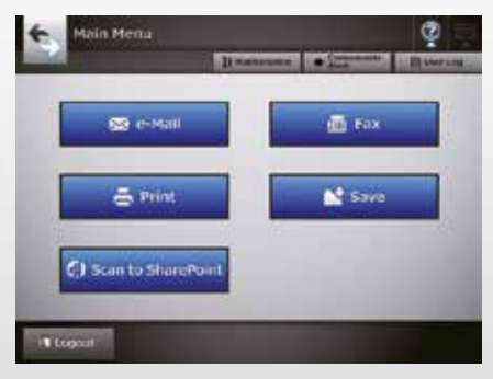
Main Menu screen